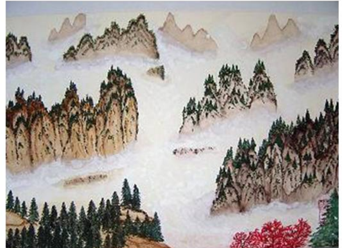
Mist and Peak Intertwine

The landscape paintings of Enso San Yong are not based on that which is physically apparent to a painter's eye at the moment, but more frequently, the recalled scenery of his decades of travel through China and later America. His landscape images were not only brushed on paper, but also hidden in a durable medium, which he invented through years of long painstaking scientific research.